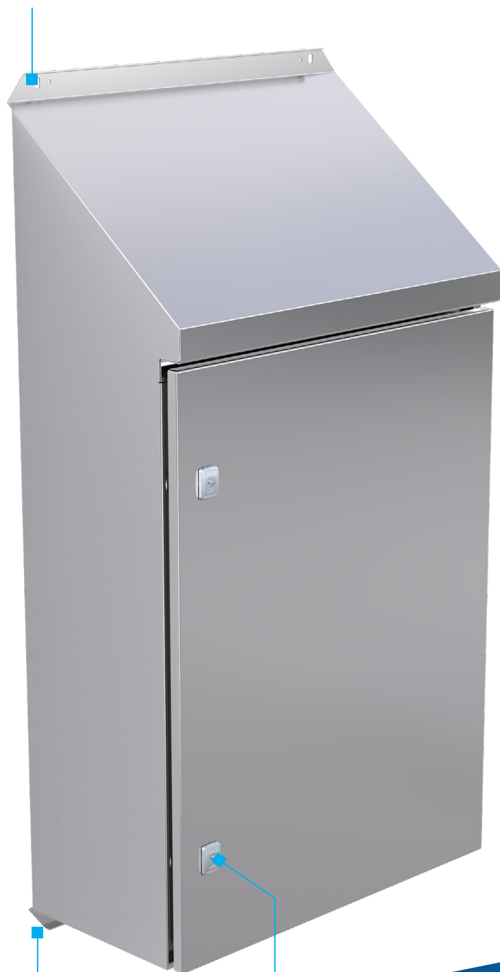
Integrated wall brackets