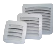
Grille and filter