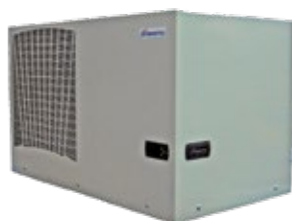
ETE Series mild steel

Cosmotec ETE Series (Available in 304 or 316 Stainless Steel on Request)