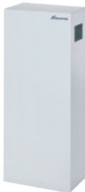
EXW Series Stainless steel