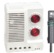
Electronic hygrotherm (temperature and humidity control)