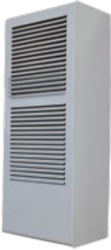
CVO Series Zinc plated steel

Self-cleaning condenser coil and concealed XCB electronic thermostat ensure the CVO units operate 24/365 for a reliable solution in outdoor environments. The internal and external circuits are separated ensuring all vital componentry and enclosure interior are free from dust, aggressive air and sprayed water. Consider the CVO range not only in outdoor environments, but also in indoor washdown and harsh areas. Display needed for set point changes.