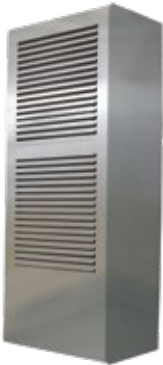
CVO Series Stainless steel