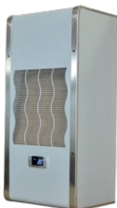
CVE Series mild steel