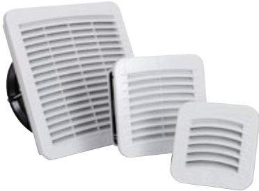
GSV Series comes assembled