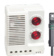
Electronic hygrotherm (temperature and humidity control)