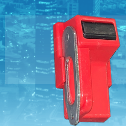
Non-captive toggle lock