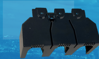
Terminal cover wide