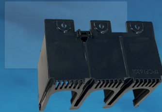
Terminal cover standard