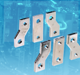
Flanged extension bars