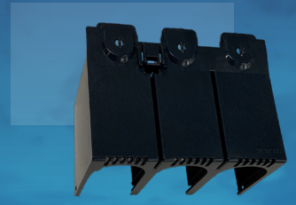
Terminal cover extended