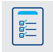
NHP Project Management