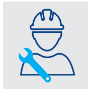
Extensively trained and qualified service technicians