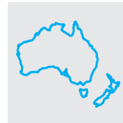
National Service Network