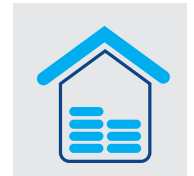
Extensive local stockholding