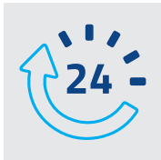
24/7/365 Emergency Service