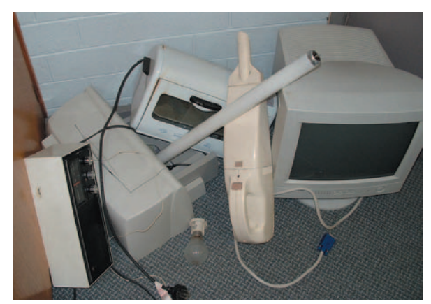
Excessive voltage can cause early failure

The main purpose of a common standard voltage in different countries is to allow easier trade between countries. Up to now, many electrical products have required different models to cover 220 V and 240 V applications. There have been product failures when 220 V designs have been applied at 240 V. The 240 V plus the upper variation permitted in the actual supply voltage becomes too great and the life of the product becomes very short. If you consider an electric room heater with a nominal power rating of 2 kW at 230 V, at the lowest permitted utilization voltage for a 220 V