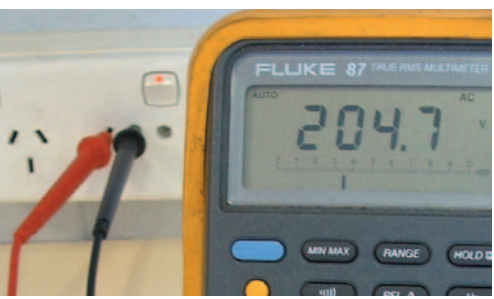
At the outlet you can have between 204.7 V and 253 V

The new system voltage levels were introduced during February 2000 by Australian standard Standard voltages AS 60038-2000. This standard is a based on the international standard IEC 60038. Since that date, electrical supply companies have generally tried to meet the requirements of the standard but there is no mandatory requirement for them to do so.