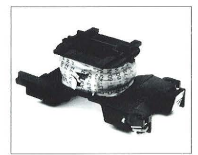
Fig. 2. Contactor coil with burnt out winding

The cross section of wire used in most coils is very small (decreases as voltage increases). It is possible for a chemical attack to cut through the wire very quickly. The most vulnerable section is the attachment to the terminal. The copper wire can be exposed at this point, and if any soldering fluxes, or other contaminants are present, problems can arise. If the coil separates at the attachment point there will usually be no sign of overheating of the coil, as occurs with most other modes of coil failure.