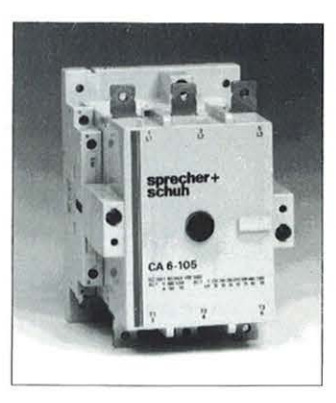
Fig. 1. The modern contactor is the product of many years of refinement.

The insulation materials also have a life which is dependent on temperature. The normal expectation is that the life is halved for every 10°C increase in temperature.