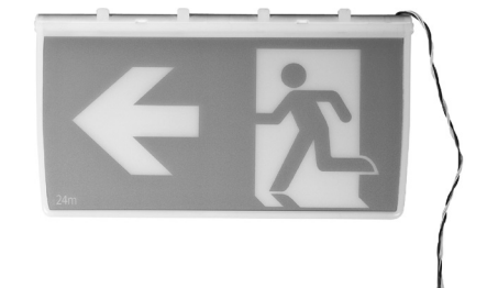
Figure 2: Connect wire loom plug to the mother board

3. Install the pictograph inserts by sliding into the diffuser. The pictograph inserts can be installed in the diffuser prior to installing the diffuser assembly in the fitting. Fitting is supplied standard with all pictograph insert options for single and double sided, as a complete one box solution to meet any site/project needs.