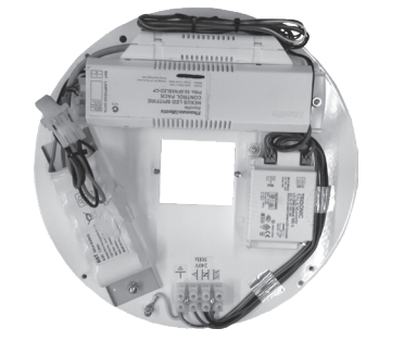
Figure 1: Mounting holes and mains cable entry option