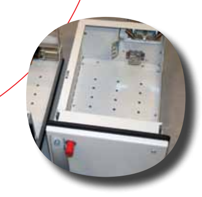
40A 1.5x1 drawer The 40A drawer for increased competitiveness.