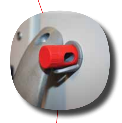
Push botton Custom designed push button with integrated padlocking.