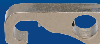
Cat: DTLD Non Captive Lock