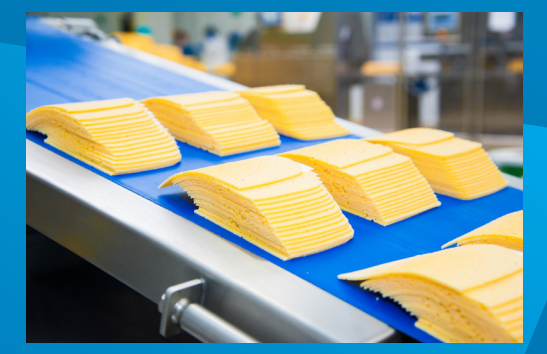
Sliced cheese production