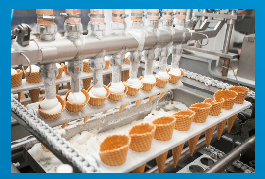
Ice cream production