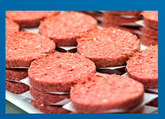
Hamburger pattie production